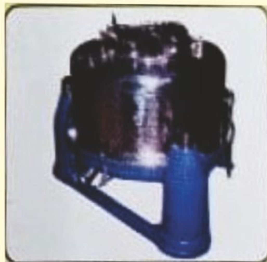
3PT STD MANUAL TOP DISCHARGE TYPE CENTRIFUGE