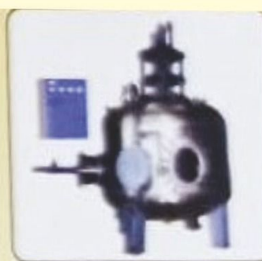
AGITATED NUTSCHE FILTER