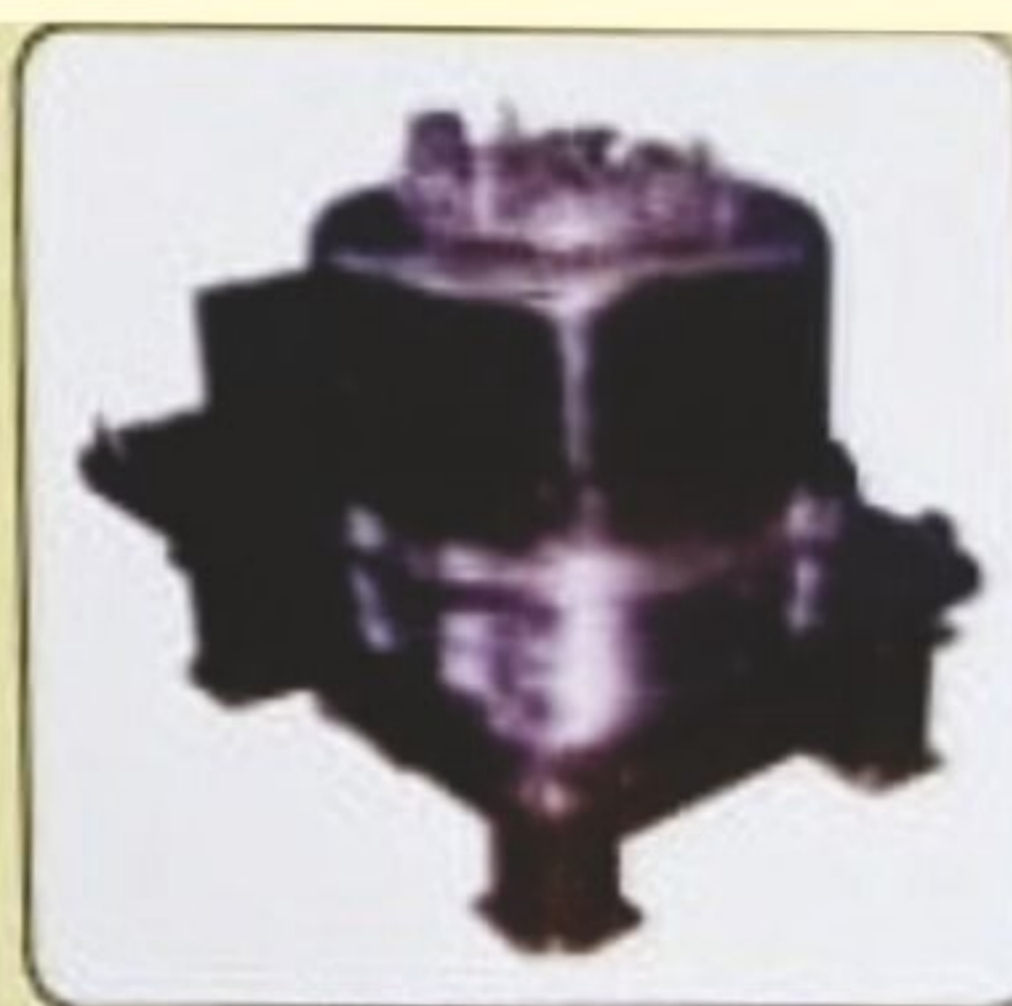
48" 0 FOUR POINT GMP CENTRIFUGE