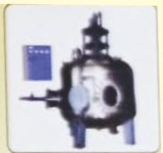
AGITATED NUTSCHE FILTER