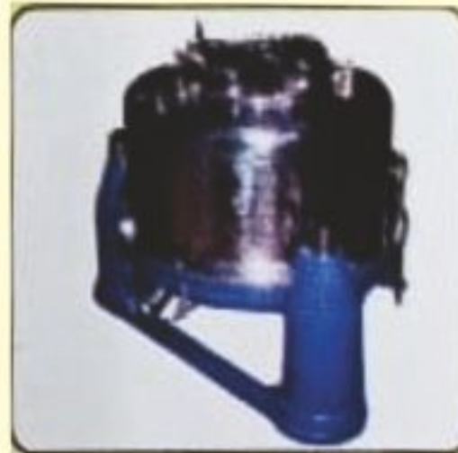
3PT STD MANUAL TOP DISCHARGE TYPE CENTRIFUGE