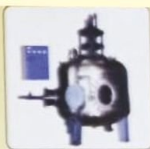
AGITATED NUTSCHE FILTER