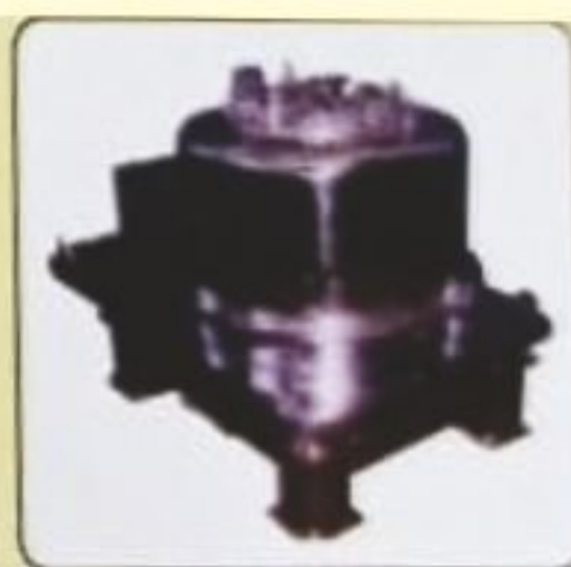
48" O FOUR POINT GMP CENTRIFUGE