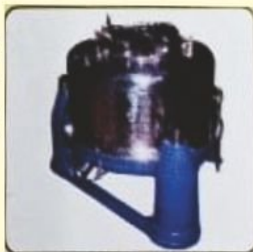
3PT STD MANUAL TOP DISCHARGE TYPE CENTRIFUGE