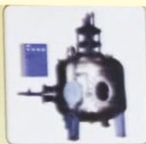
AGITATED NUTSCHE FILTER