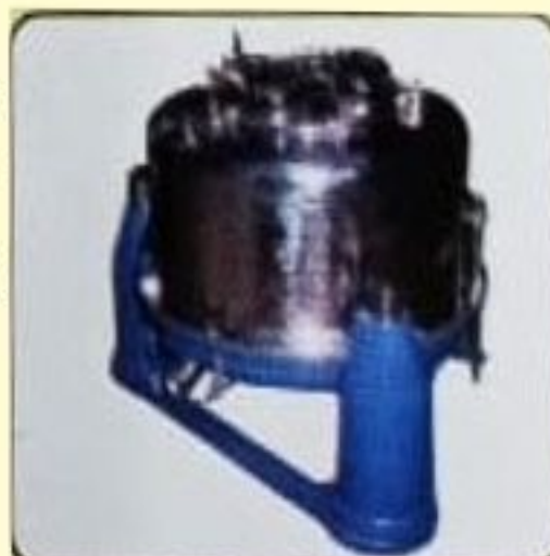
3PT STD MANUAL TOP DISCHARGE TYPE CENTRIFUGE