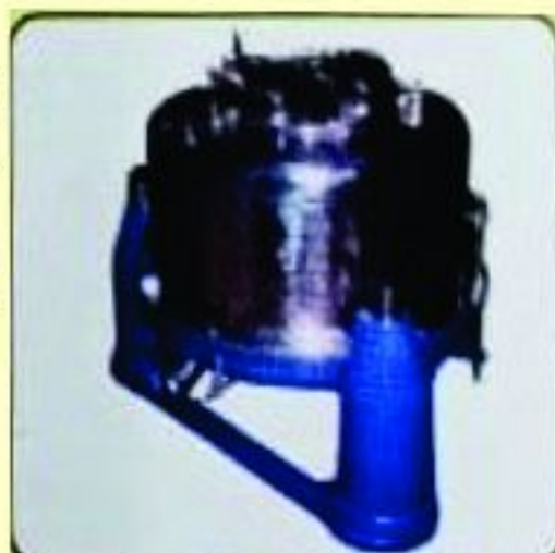
3PT STD MANUAL TOP DISCHARGE TYPE CENTRIFUGE