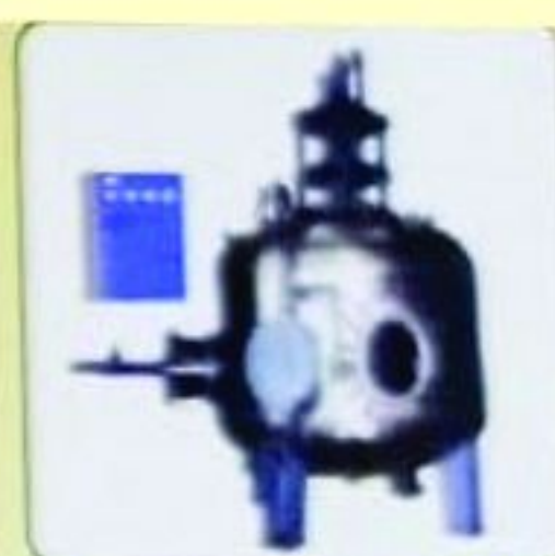
AGITATED NUTSCHE FILTER