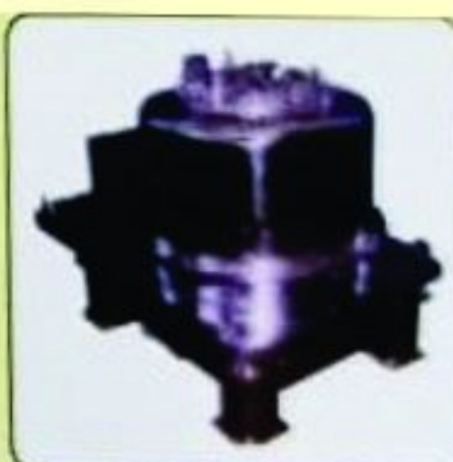
48" O FOUR POINT GMP CENTRIFUGE