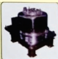
48" O FOUR POINT GMP CENTRIFUGE