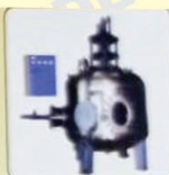
AGITATED NUTSCHE FILTER