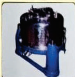
3PT STD MANUAL TOP DISCHARGE TYPE CENTRIFUGE