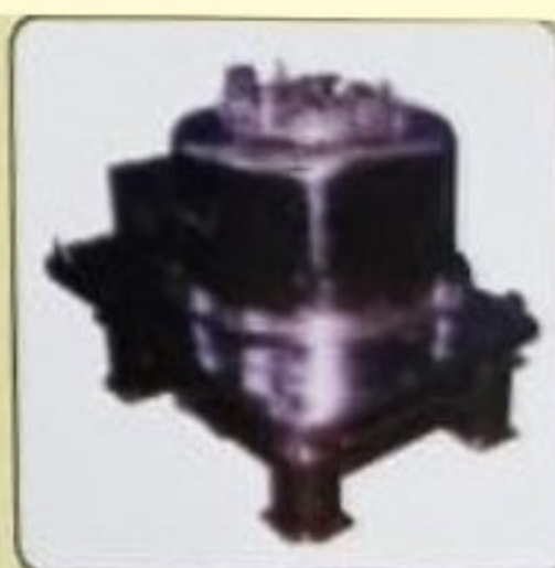
48" O FOUR POINT GMP CENTRIFUGE