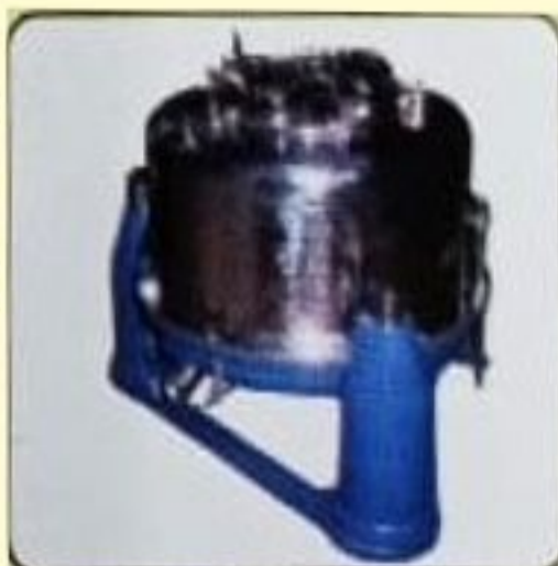
3PT STD MANUAL TOP DISCHARGE TYPE CENTRIFUGE