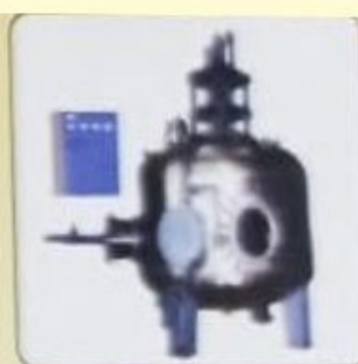
AGITATED NUTSCHE FILTER